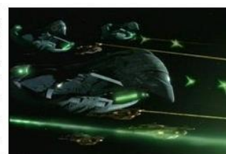
Cardassians and Romulans open fire

As the Fleet entered the Orbit of the Founders Home world, they found the planet completely undefended. They had apparently achieved the element of surprise. Tain confidently ordered the fleet to de-cloak and fire. Thirty percent of the Planets