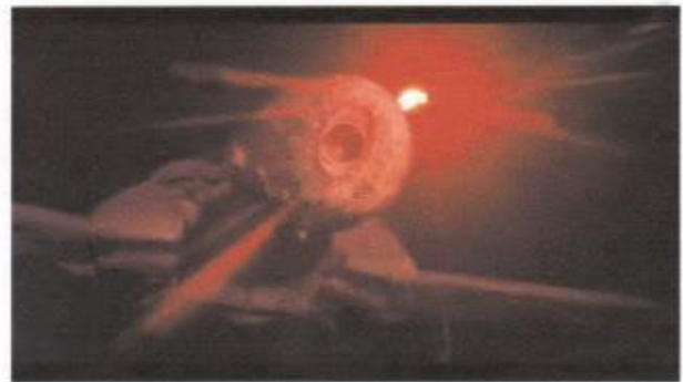
Klingon Bird-of-Prey firing while cloaked (Star Trek VI: The Undiscovered Country)

Enterprise was also responsible for an encounter with another organization that used stealth technology, the Romulan Star Empire. In April 2152, the ship accidentally entered a cloaked minefield protecting a